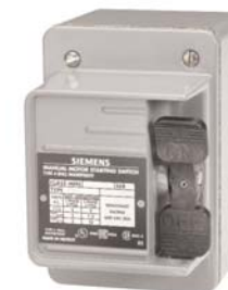
MMSKW1 NEMA 4