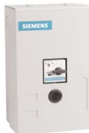
Class 11 NEMA 1