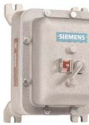
Class 11 NEMA 7 & 9