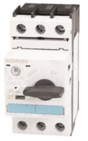
Class 11 Open

Signaling contacts are used to indicate starter trips including short circuit trips. The undervoltage release indicates low voltage to the motor. For shunt trip indication, use the snap-on shunt trip module. For conforming to the "Type E" self protected combination starter, use the terminal cover to provide protection required for the terminals.