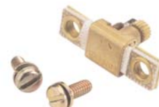
Heating Element for Class SMF

The SMF product line is available with red or green indicator lights, and a lockable mechanism. Toggle or key operated units for flush or surface mounted devices in open, NEMA Type 1, 3R, 4, 12, 7, and 9 are available for various applications. Heater elements to protect motors from overload currents are used with these devices.