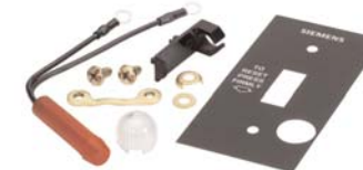
Light Kit for Class SMF, MMS, MRS