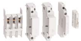
Class 11 Accessories