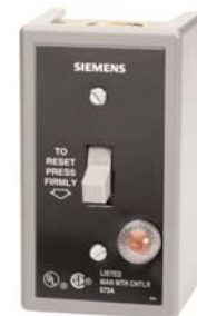
SMFFG1P With Light